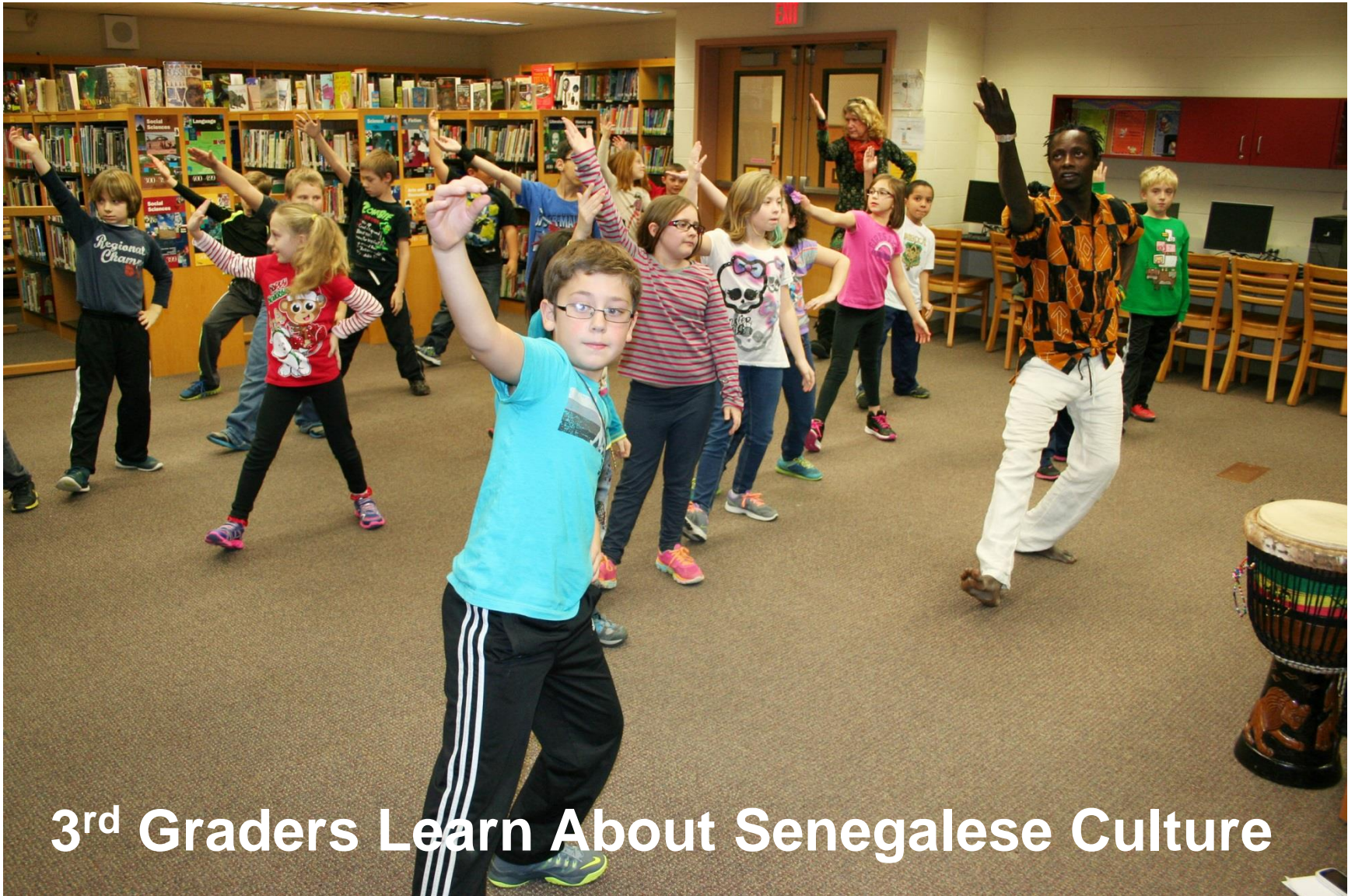
3 rd Graders Learn About Senegalese Culture

The Budget underwrites a world of possibilities.