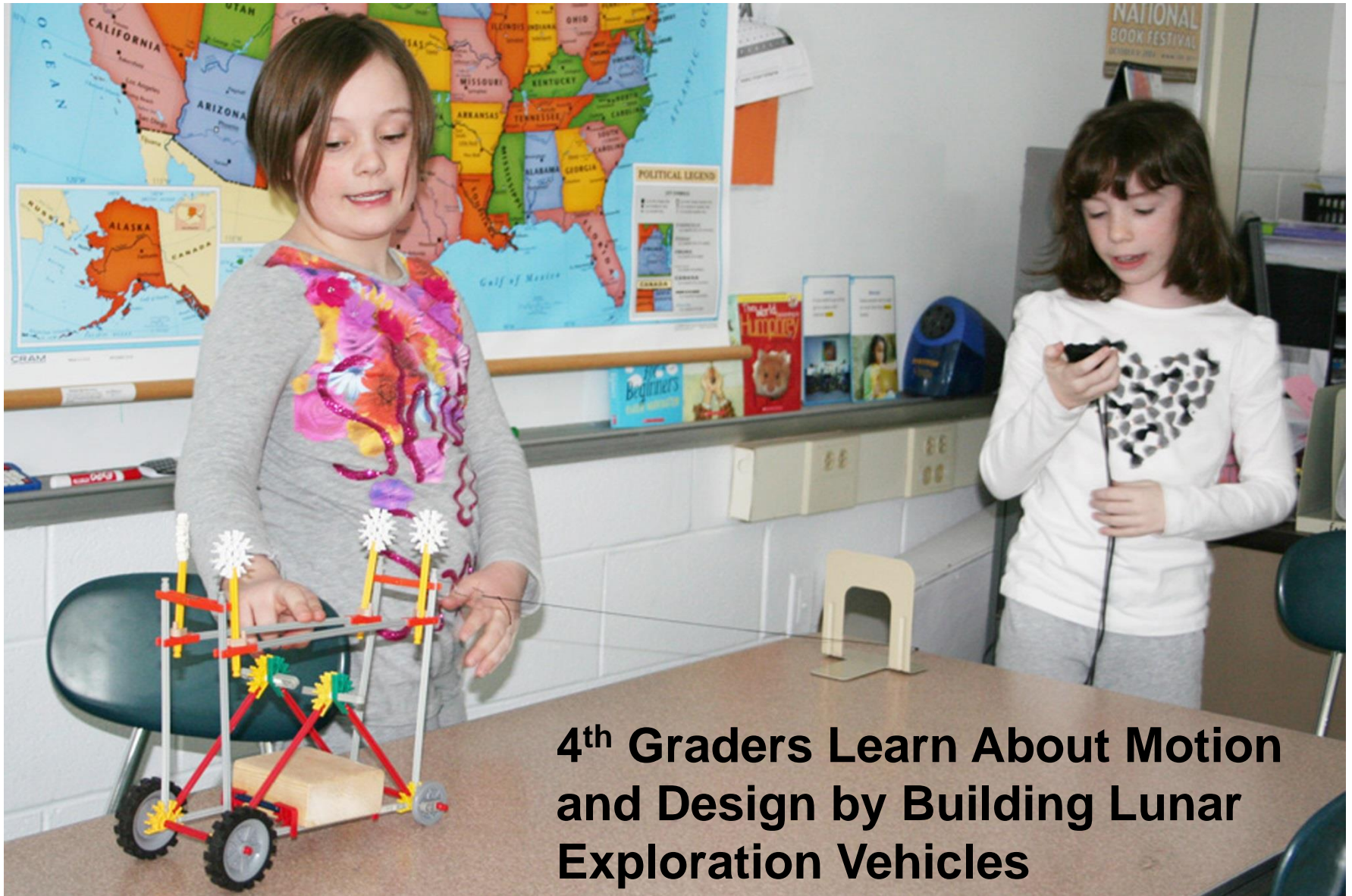
4 th Graders Learn About Motion and Design by Building Lunar Exploration Vehicles

The Budget supports opportunities for engagement.