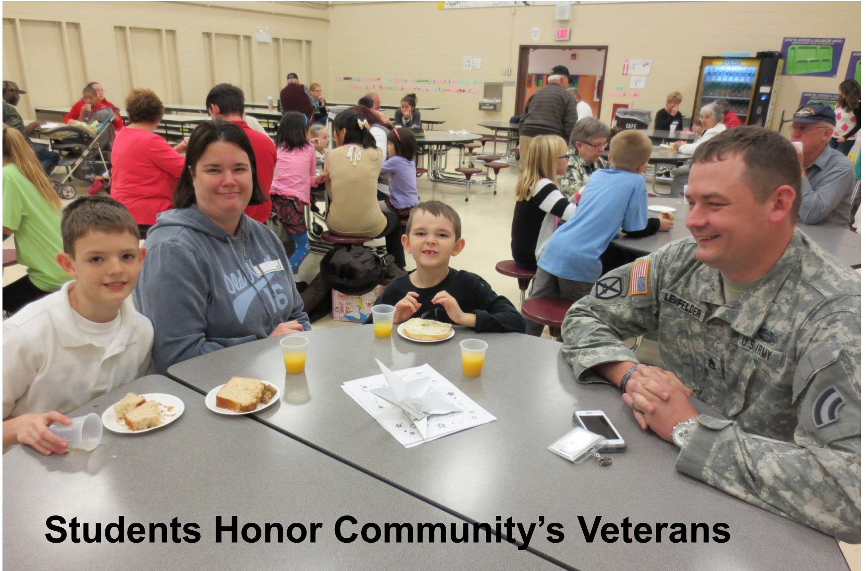
Students Honor Community's Veterans

The Budget is a financial plan that underwrites our values and beliefs.