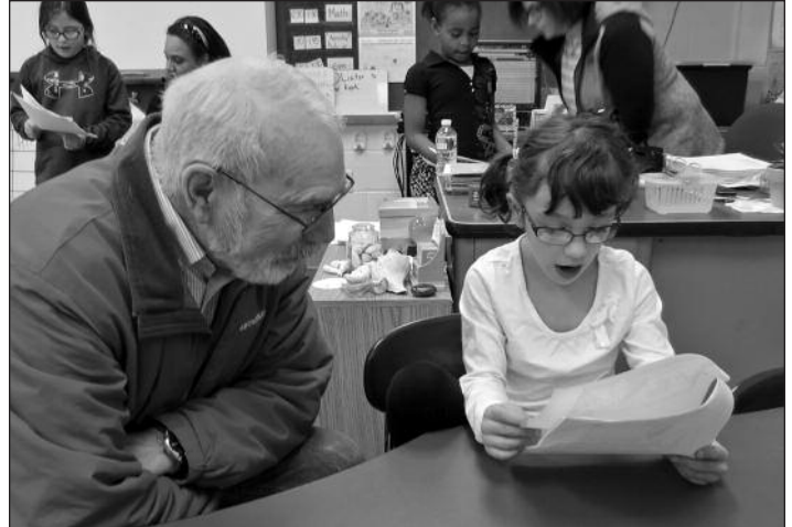
A second grader proudly reads something she wrote to a family member.