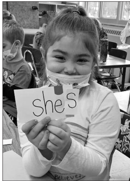
To make learning fun, 1st graders wore surgical masks to perform "surgery" on contractions. Students were given two words and used "scalpels" to remove letters to create a contraction.

The district will also continue an investment in the school's