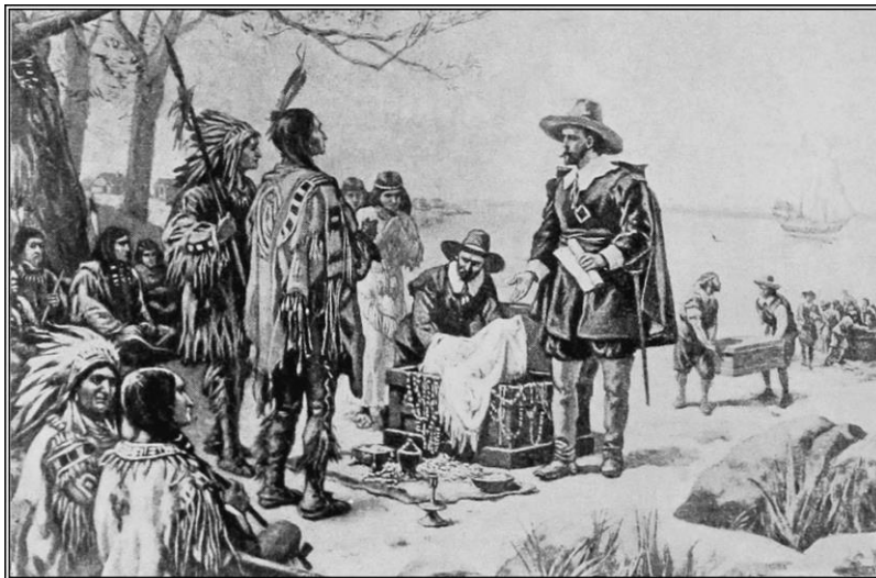
The Manhattan Purchase

Here are some facts about Puerto Rico! You might not think this but Puerto Ricans are actually Americans. The capital of Puerto Rico is San Juan. There is a City Hall where there is a glass floor, and you can see the highway under you. The nickname of Puerto Rico is called: Island of Enchantment. The actual name of Puerto Rico is called: Commonwealth of Puerto Rico. Puerto's original name was: San Juan Bautista.